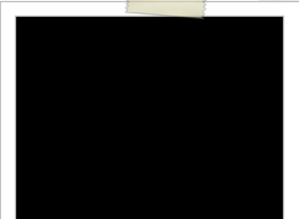
This was the only photo that was sent in from Blackpool, I guess it was taken at night !!

Any member who wishes to perform for DMC, please contact Allan Humphries with their details